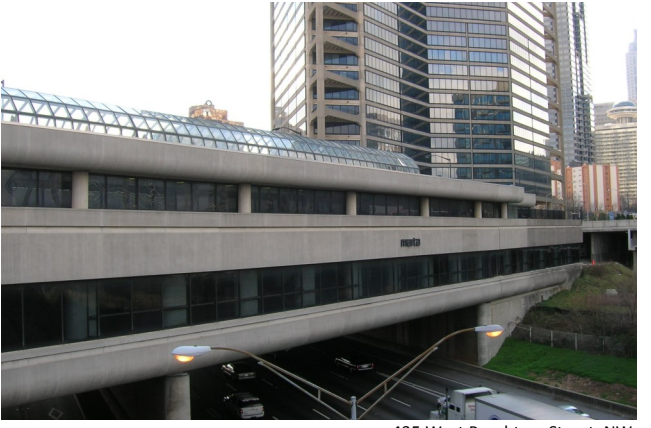
435 West Peachtree Street, NW Atlanta, GA 30308

Civic Center Station is a MARTA heavy rail transit facility serving MARTA's Red and Gold Lines located at the north end of Downtown Atlanta. It is the world's only rail station built over a highway and underneath a city arterial road. Civic Center Station provides rapid rail access to major destinations including Buckhead (14 minutes), Five Points (2 minutes), and Hartsfield-Jackson International Airport (18 minutes).