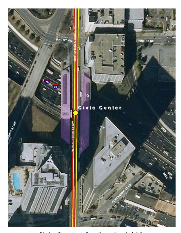
Civic Center Station Aerial View

The majority of the land use surrounding Civic Center Station is dedicated for commercial purposes such as office space and other nearby attractions. Residential makes up the second largest land use category within a half mile. The housing in the area is composed of a mixture of high end condominiums and student housing such as Techwood Apartments. Due to the proximity of Georgia Tech, high density student housing appears to be the dominant housing type in the area.